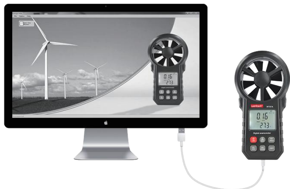
USB communication function