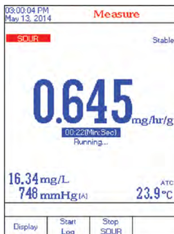
SOUR (Specific Oxygen Uptake Rate)