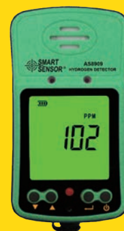
Hydrogen Detector AS8909