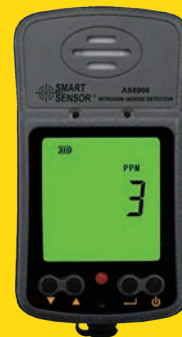
Nitrogen Dioxide Detector AS8906