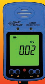
Ozone Detector AS8908