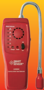
Combustible Gas Detector AS8800