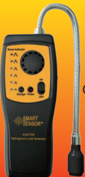
Refrigerant Gas Detector AS5750