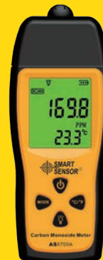
Carbon Monoxide Detector AS8700A