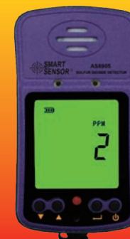
Sulfur Dioxide Detector AS8905