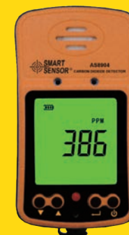
Carbon Dioxide Detector AS8904