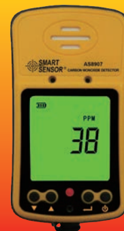
Carbon Monoxide Detector AS8907