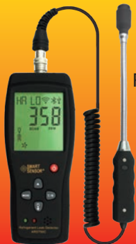
Refrigerant Gas Detector AR5750C 0~1000PPM