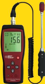
Combustible Gas Detector AS8800A 0~50% LEL