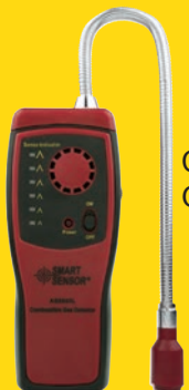
Combustible Gas Detector AS8800L