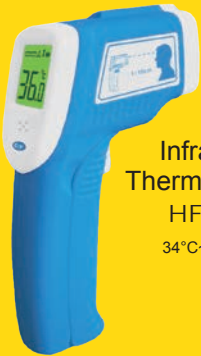
Infrared Thermometer HF110 34°C~ 45°C