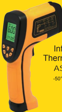
Infrared Thermometer AS842A -50°C~600°C