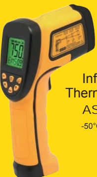
Infrared Thermometer AS852B -50°C~750°C