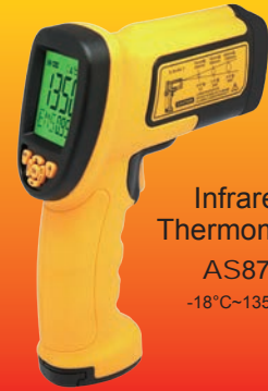
Infrared Thermometer AS872 -18°C~1350°C