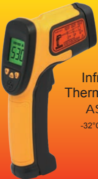
Infrared Thermometer AS530 -32°C~550°C