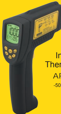
Infrared Thermometer AR862D+ -50°C~1000°C