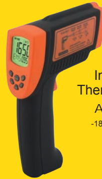
Infrared Thermometer AR882+ -18°C~1650°C