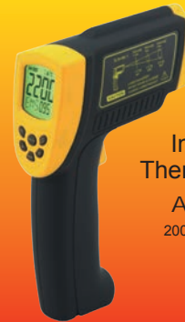
Infrared Thermometer AR892+ 200°C~2200°C