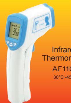
Infrared Thermometer AF110A 30°C~45°C