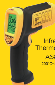
Infrared Thermometer AS892 200°C~2200°C