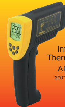
Infrared Thermometer AR922+ 200°C~2500°C