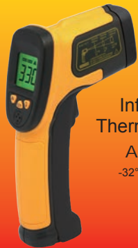
Infrared Thermometer AS330 -32°C~330°C