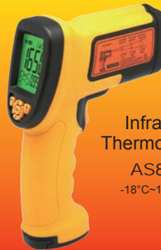
Infrared Thermometer AS882 -18°C~1650°C