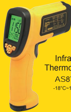
Infrared Thermometer AS872D -18°C~1150°C