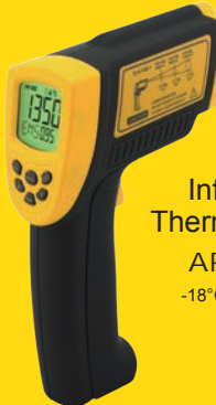
Infrared Thermometer AR872+ -18°C~1350°C