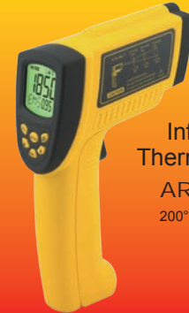
Infrared Thermometer AR882A+ 200°C~1850°C