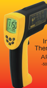
Infrared Thermometer AR872D+ -50°C~1150°C