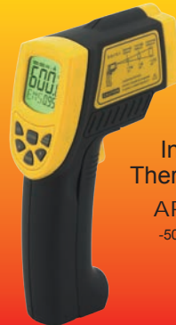
Infrared Thermometer AR842A+ -50°C~600°C