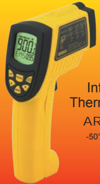
Infrared Thermometer AR862A+ -50°C~900°C