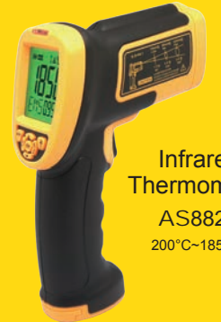
Infrared Thermometer AS882A 200°C~1850°C